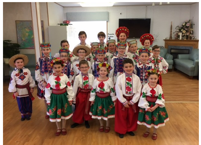
Ages 4-14, these dancers sure are good!