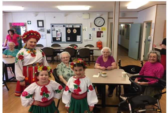
Sopilka Dancer stop by the Manor!