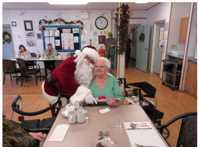
Santa Clause is coming to town!