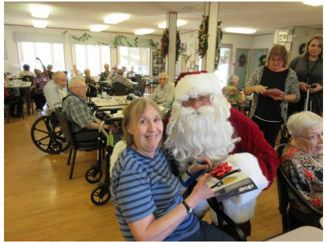
Who's on the Nice list?