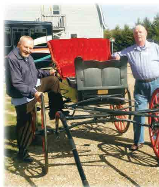
Day Support clients visited museum

Like what you see? Visit www.smhg.ca for more photos