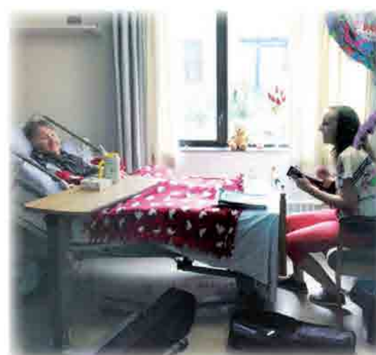
Recreation staff playing musical instrument for a resident