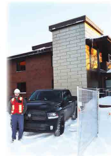
New elevator exterior entrance