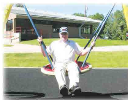
Grove Manor resident having fun in the park on a big swing!