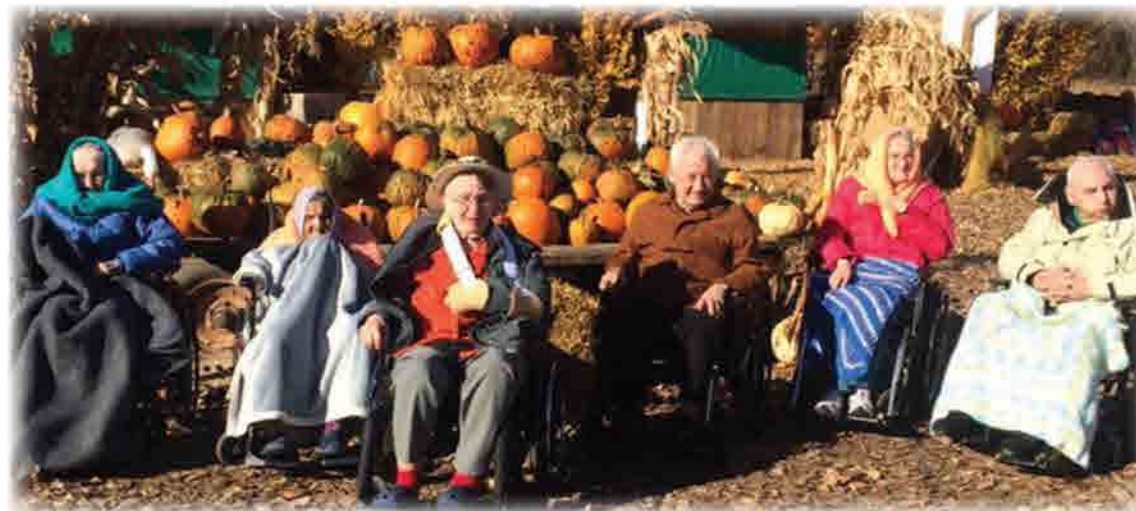
Residents visited Prairie Gardens and embraced the colorful fall surroundings