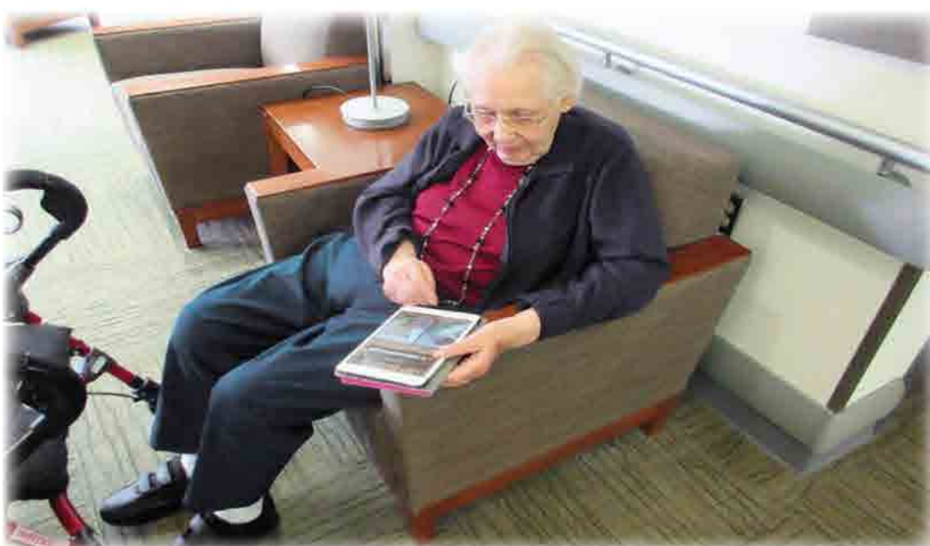
Resident engaged in interactive iPad game!

The technological revolution is not just for kids! It is for their parents and even grandparents. The recreation therapy department at St. Michael's Long Term Care Centre recently received a generous donation from the Friends of St. Michael's Society of Edmonton to purchase 4 iPads, LCD projector with screen, headphones, and speakers.