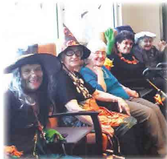
Residents had a spooktacular time when they visited Millennium Pavilion