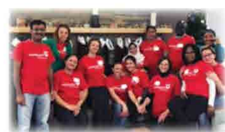
NorQuest Student Volunteers

On Friday, November 20, 2015 we were fortunate to have volunteers from the LINC volunteer program at NorQuest College, Westmount Campus, help us with setting up Christmas trees and decorations throughout the Long Term Care Centre and Millennium Pavilion Senior's Lodge. What a wonderful way to bring the Christmas spirit to the residents' home. These amazing young students are excellent community-minded representatives of NorQuest College.