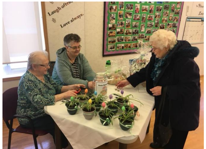
Something for everyone!