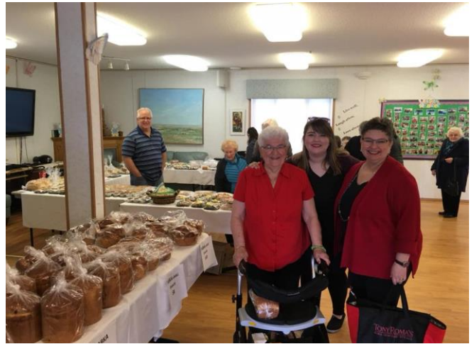
A great time at the Easter Bake Sale!