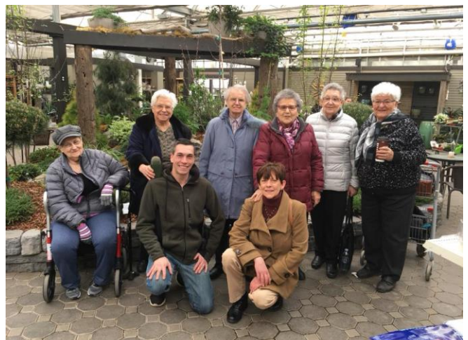
Greenland Nursery Bus Trip!

Answer: (0) there were no shamrocks in the newsletter. There were (20) four-leaf clovers.