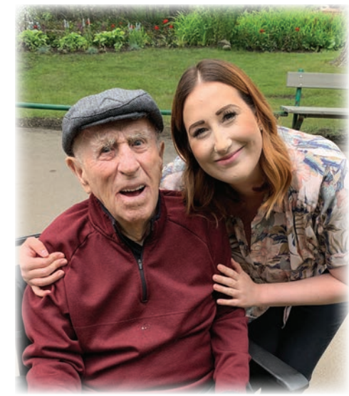
Resident enjoying a wonderful recreational outing at the Zoo

Since the weather warmed up, the residents have been taking advantage of it! The Recreation Therapy Department planned multiple outdoor activities for the summer months. This summer we went to Elk Island Park and Jurassic Forest for the first time, we had such a great time we will be returning next summer. Some of residents that went haven't been to Elk Island National Park in years and expressed how