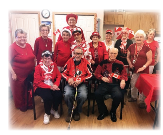
Residents sporting their Canadian swag to celebrate our great nation

Summer is such a lovely time to enjoy the outdoors and this summer our residents have been doing just that... going on picnics, to special events in the community, enjoying BBQ's and staying active with afternoon walks. Even with a rainy summer season we were very fortunate that we had nice