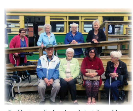
Residents excited and ready to take a ride on Edmonton'y Radial Railway

expansive University of Alberta Botanic Gardens. We were immersed in history while visiting the Ukrainian Village and met (and fell in love with) some wild animals at the Edmonton Valley Zoo.