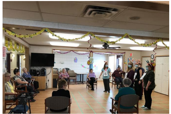
Bunny Races for Easter