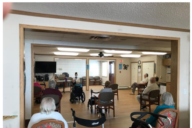
Health Series Presentation-Oral Health