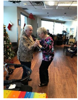
Residents celebrating December birthdays!