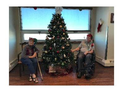
Residents had photos taken for Christmas!