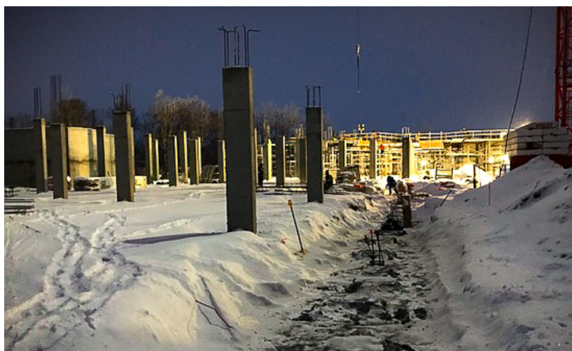
Construction: March, 2021

More information can be found at fenwyckheights.ca