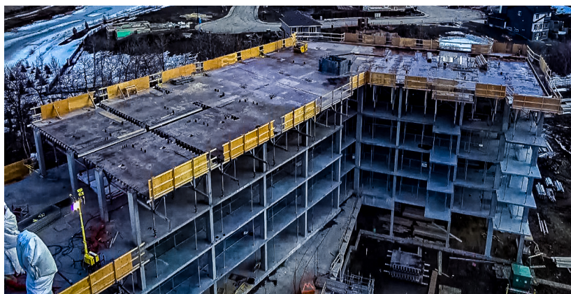
Construction: May, 2021