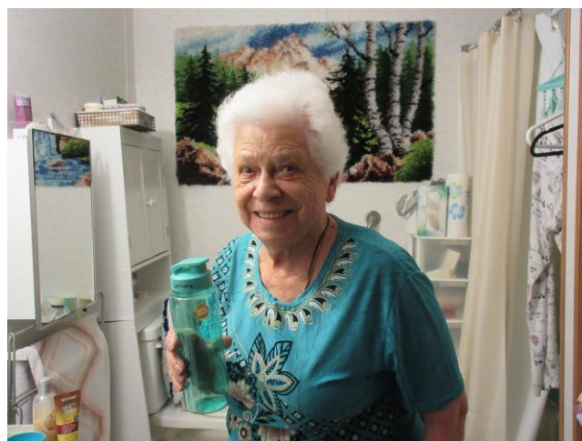
Love my new water bottle