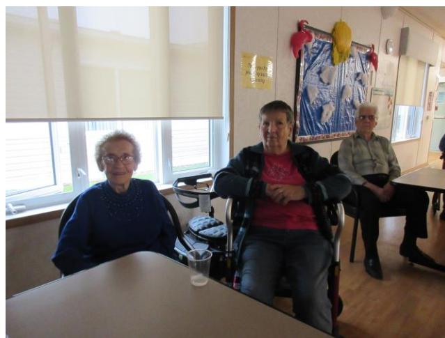
Karaoke time is great