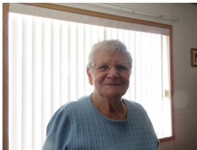
Always ready with a smile