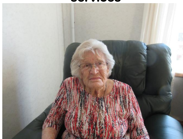
Sunshine makes me happy