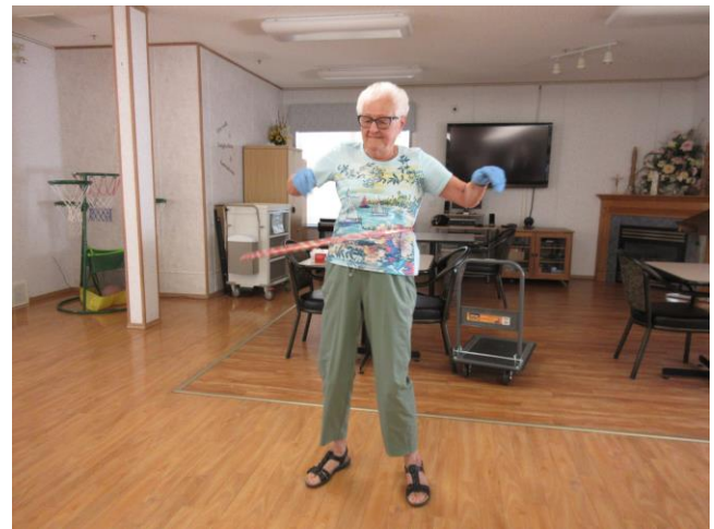
Hula hoop champion