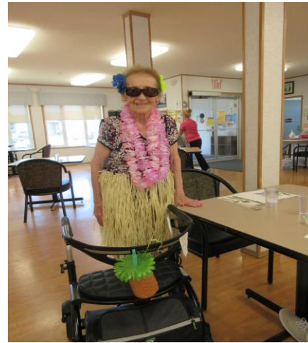
Our little Hawaiian