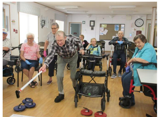
Curling enjoyed by all