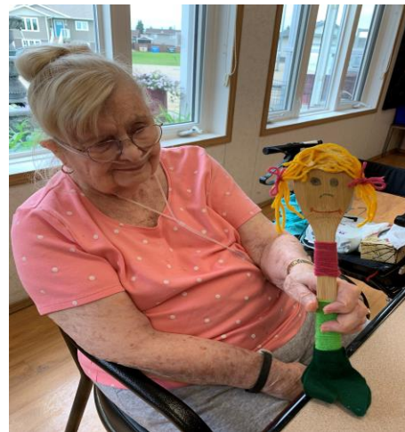
Isn't she cute?