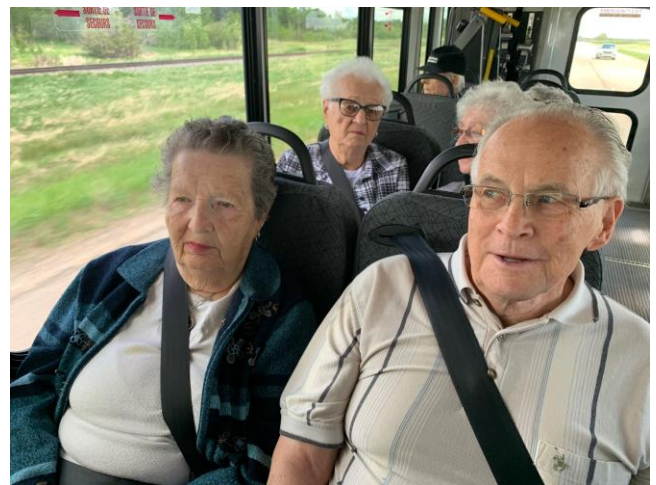
Did you see that?