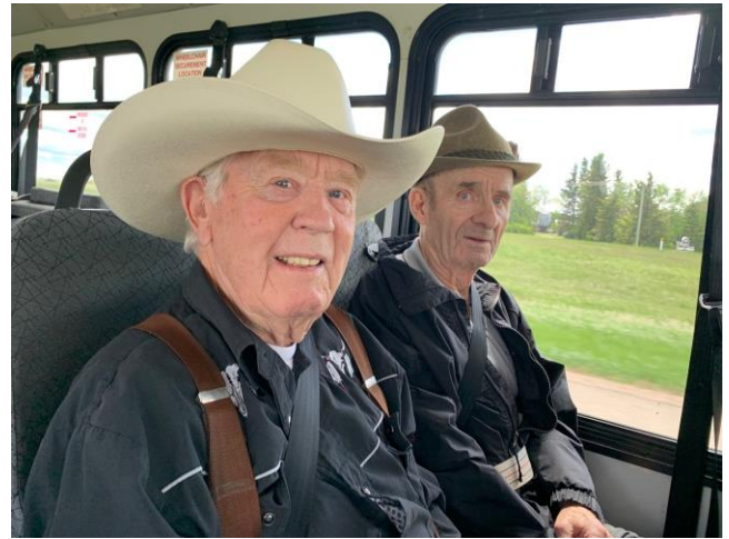
Enjoying the country drive