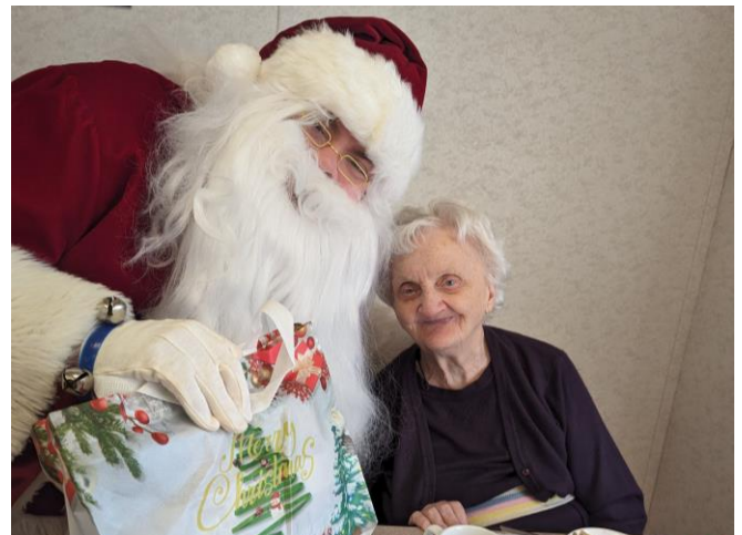
Santa Stopped By!