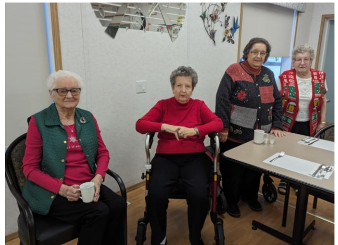
Beautiful Christmas Sweaters!