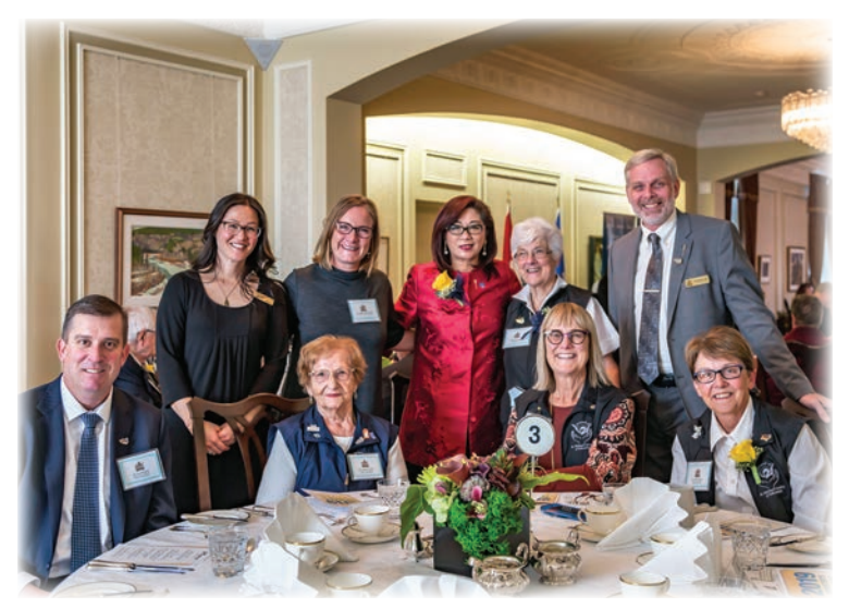
Friends of St. Michael's Society of Edmonton were a recipient of the 2019 Ministers Seniors Service Award

With 85 members currently, almost all Friends members are themselves senior citizens, and most are retired. However, there are a handful of members who are still working and volunteering at the same time or volunteering with FOSMSOE as well as different community organizations. They give of their time and energy to help benefit seniors in care and those who require support.